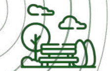
Open-to-Air Sitting with Planters