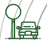
Separate Entry and Exit