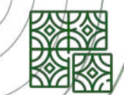
Well-Designed Entrance Lobby