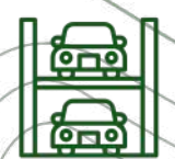
Basement with Provisional Stack Parking in Future