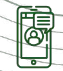
Tailor Made Society Management App