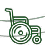
Ramp for Wheel Chair