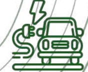
Electric Vehicle Charging Provision