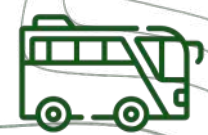
Pick-Up and Drop-Off