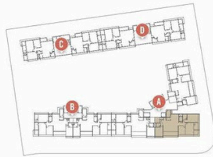
TYPE - 2A BLOCK - A