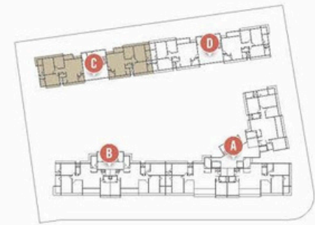
TYPE - 5 BLOCK - C