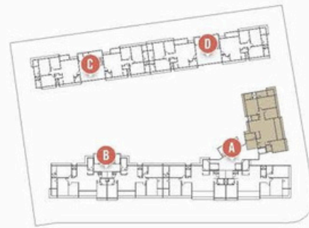
TYPE - 1 BLOCK - A