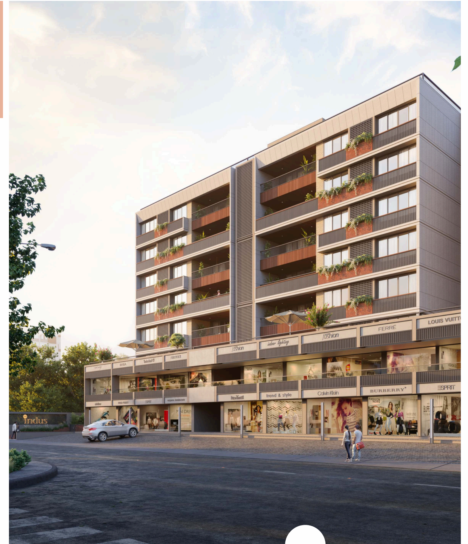
Artistic Impression of Exterior View