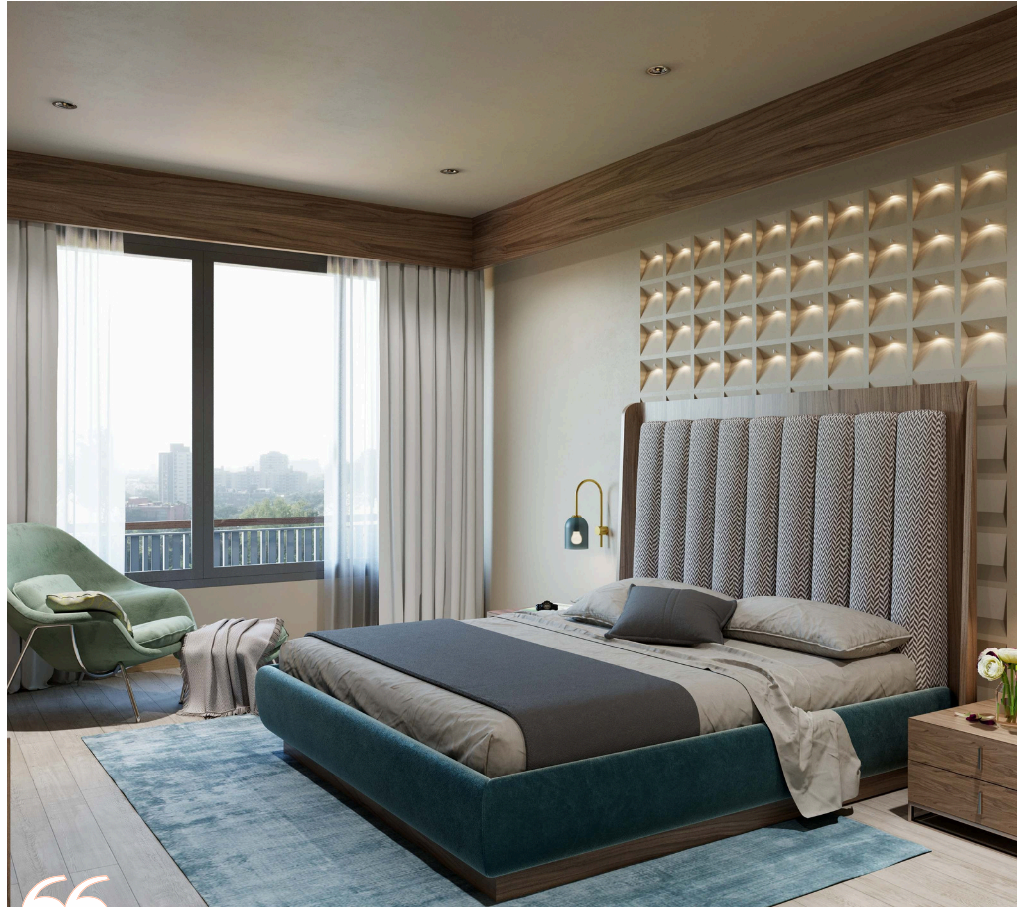
Artistic Impression of Interior View