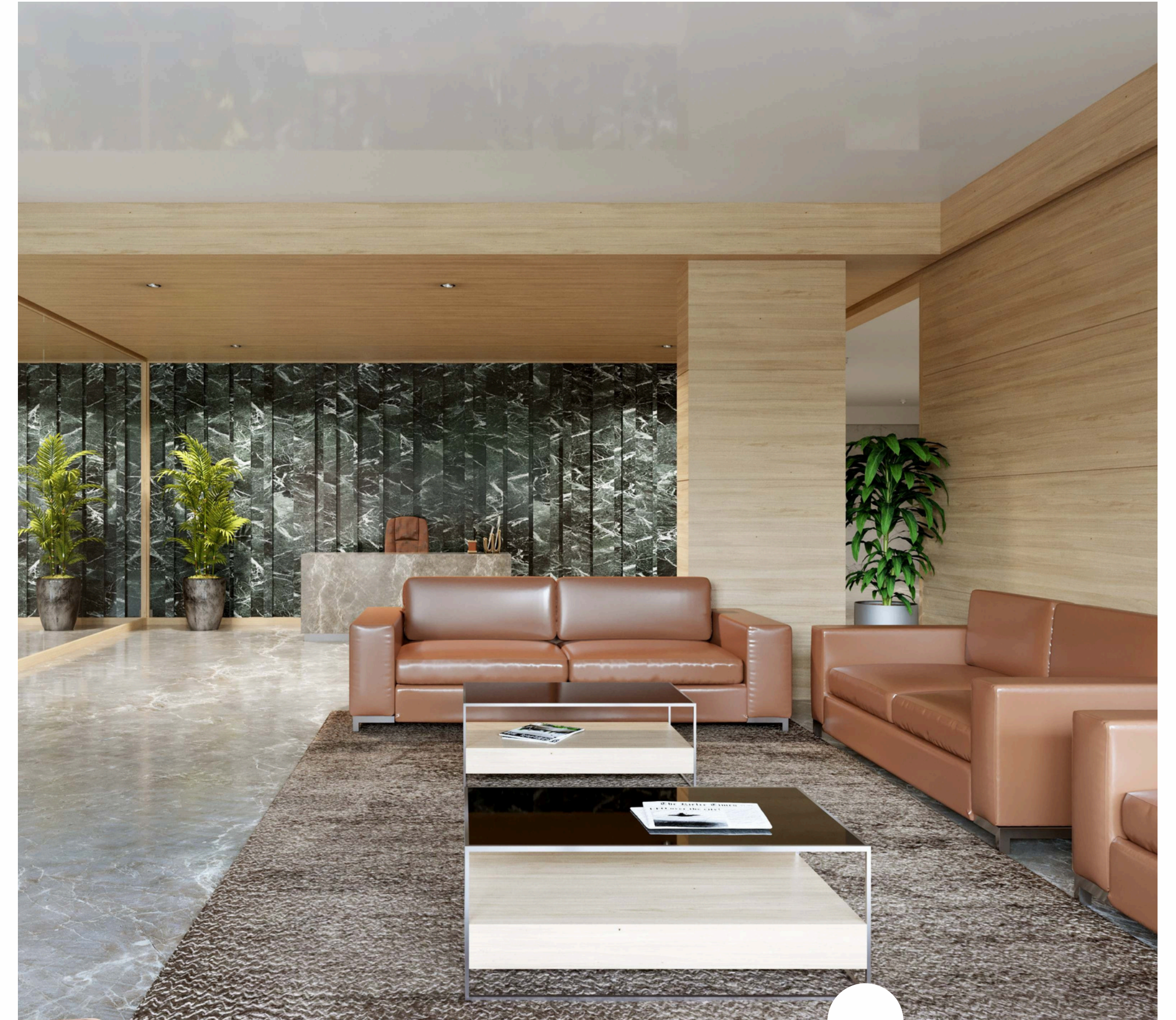
Artistic Impression of Interior View

“ your home should tell the story of who you are, and be a collection of what you love... ”