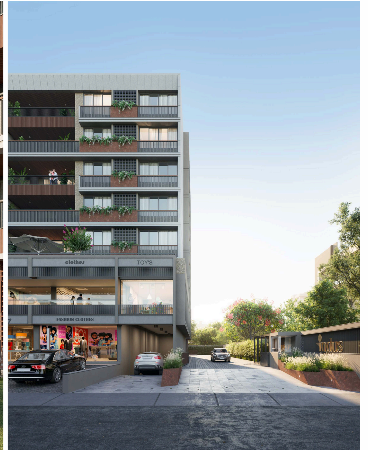
Artistic Impression of Exterior View