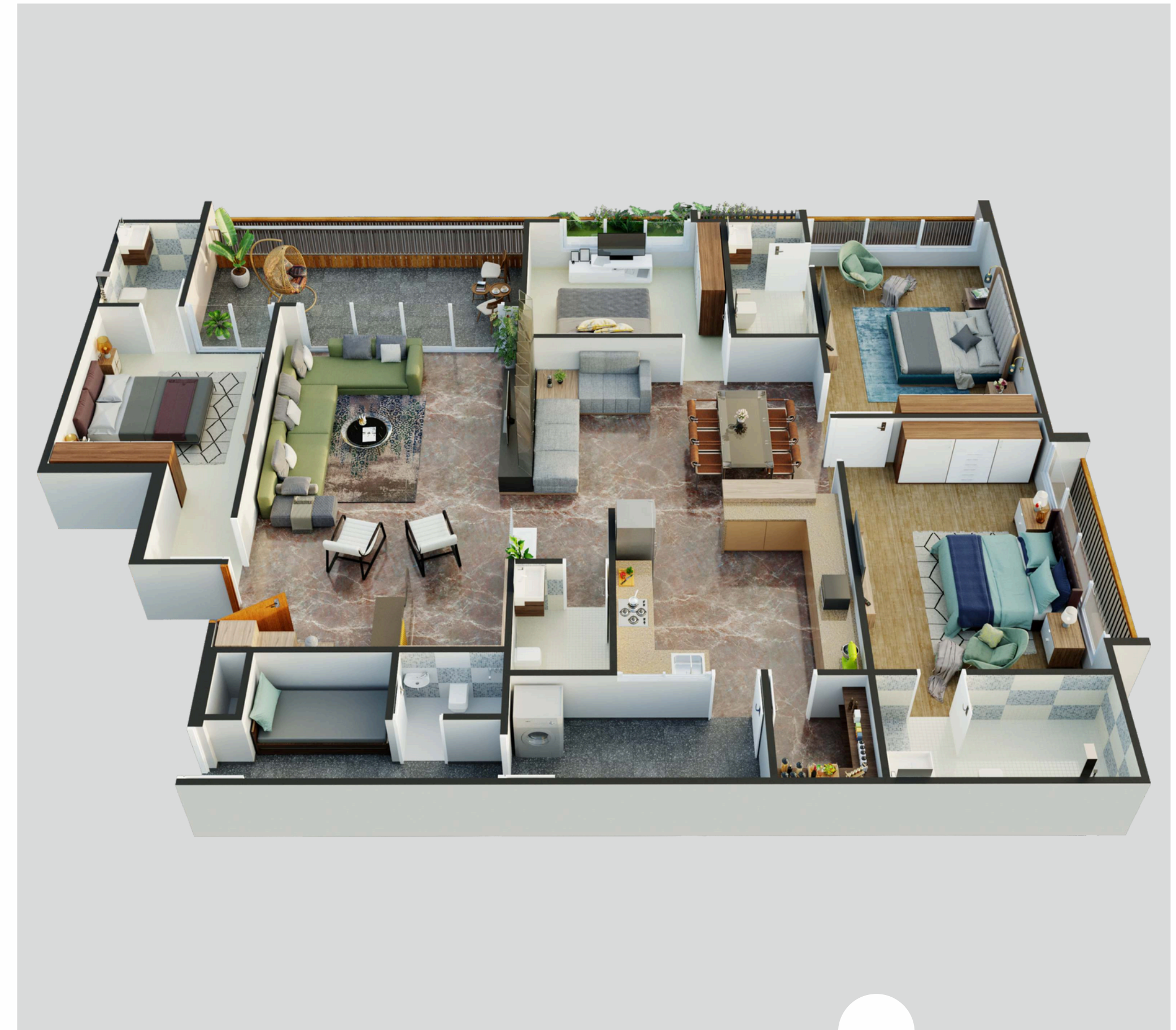
Artistic Impression of Exterior View