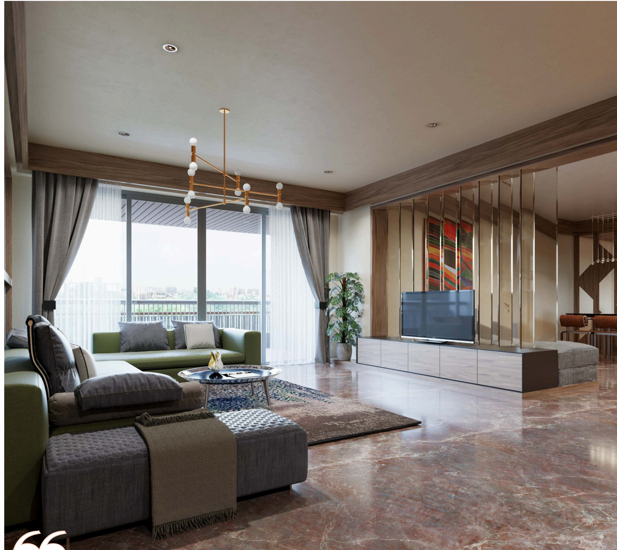
Artistic Impression of Interior View