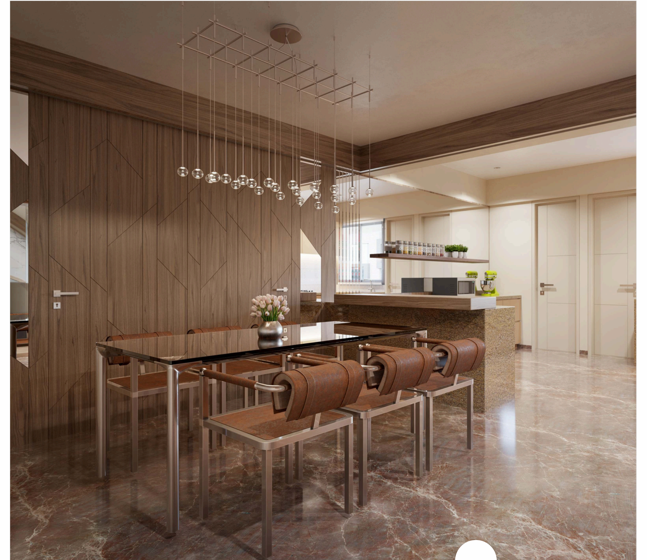
Artistic Impression of Interior View

“ AN Exclusive opulance for the selected few... Much more than comforts... ”