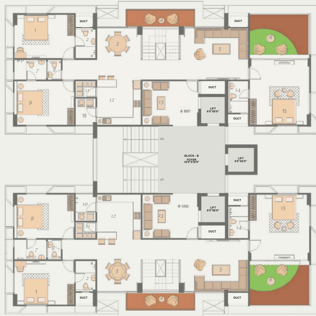
BLOCK -B 13TN FLOOR PLAN