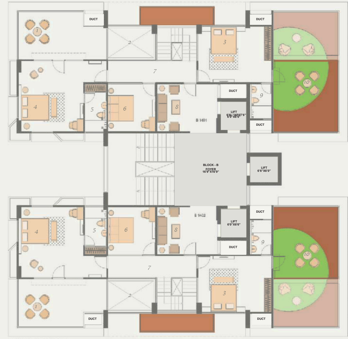
BLOCK -B 14TN FLOOR PLAN